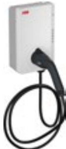
Terra AC W11-G5-R-0